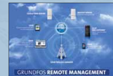
Receive input and control your pumps via your computer, mobile phone, or over the Internet