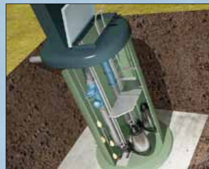
Dedicated Controls are ideal for network pumping stations, allowing reliable control of six pumps and a mixer